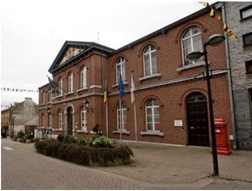
The town hall of Kelmis / DG - Ostbelgien

Don't put your light under one Bushel! You too can show how great it is They are. Get to know us and join us: