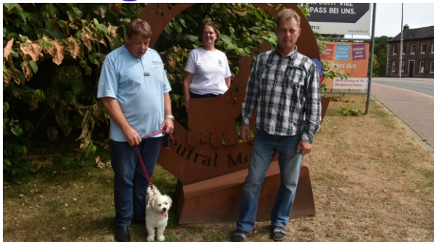
The management team of Faire Chance VoG

You can also reach us by email at: info@.fairechance.eu