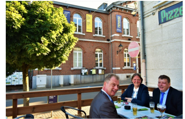
Cozy get-together after work